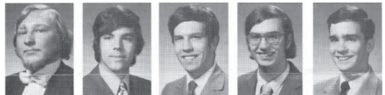
Mystery Brother 1