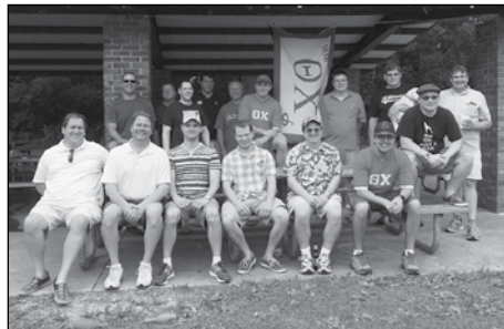
Brothers gathered for the Annual Summer Family Picnic earlier this year.