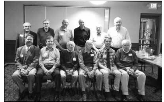
The Lariat Steakhouse played host to another great luncheon for Gamma Upsilon.