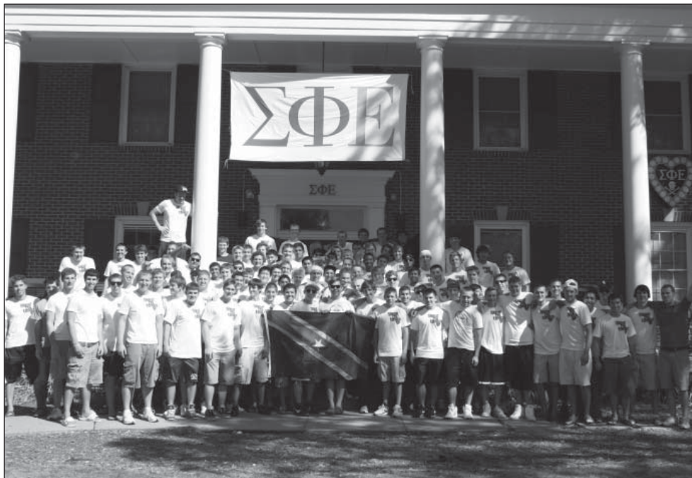
Sigma Phi Epsilon at Drake University, Fall 2010