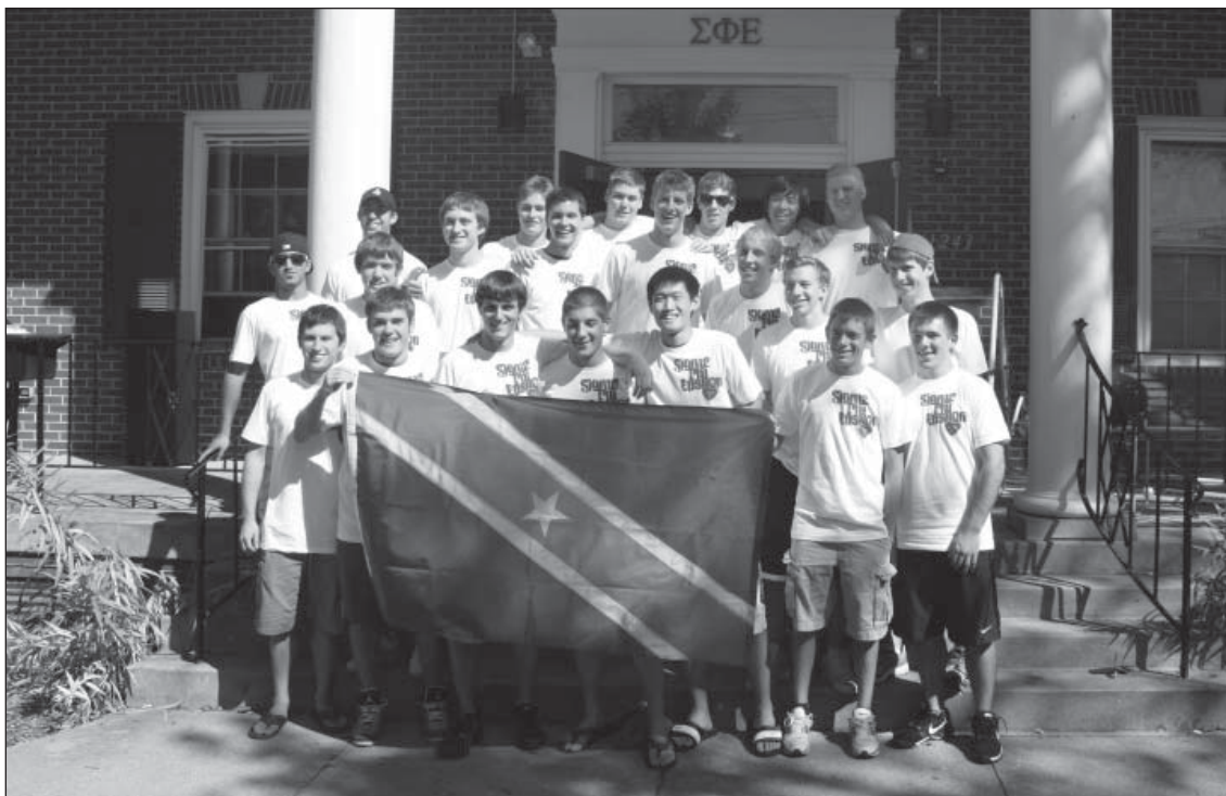
Twenty-four new brothers join SigEp.

Once again, the alumni and actives should be proud of another good recruitment year by the chapter's leadership. The ability to consistently recruit men of character who are dedicated to academics, community and fraternity shows the strength of the chapter. Congratulations to the 24 new brothers who joined the SigEp ranks!