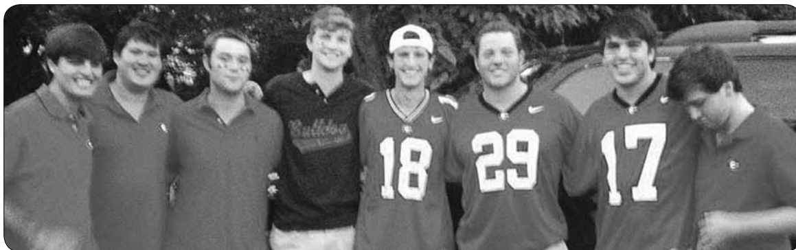
Sophomores and juniors get ready for the annual Bleeding Red & Black social with Theta.