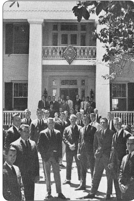
The gentlemen of Georgia Beta prepare for rush in 1962.