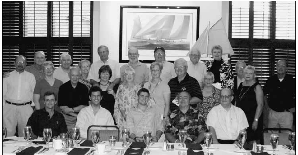
Brothers and their "Dream Girls" enjoy an evening together at last year's banquet. Maybe this year you can join us!