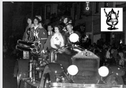
The Pi Kappa Alpha fire truck in the Homecoming parade during the 1960s. Inset: The Locomotive Bell, procured in 1940.