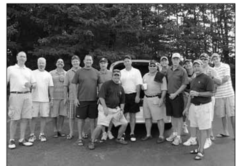
Brothers pictured at last year's Annual Pike Golf Outing and Sand Bagger Classic. Make sure you are in the picture this year!