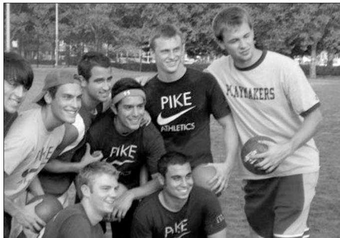
Brothers pose after winning the dodgeball championship.

Campus involvement and intramurals continue to be a focus of the brotherhood. The chapter placed 1st in IFC Soccer, 2nd in IFC Football, 2nd in IFC Basketball and 3rd in IFC Hockey.