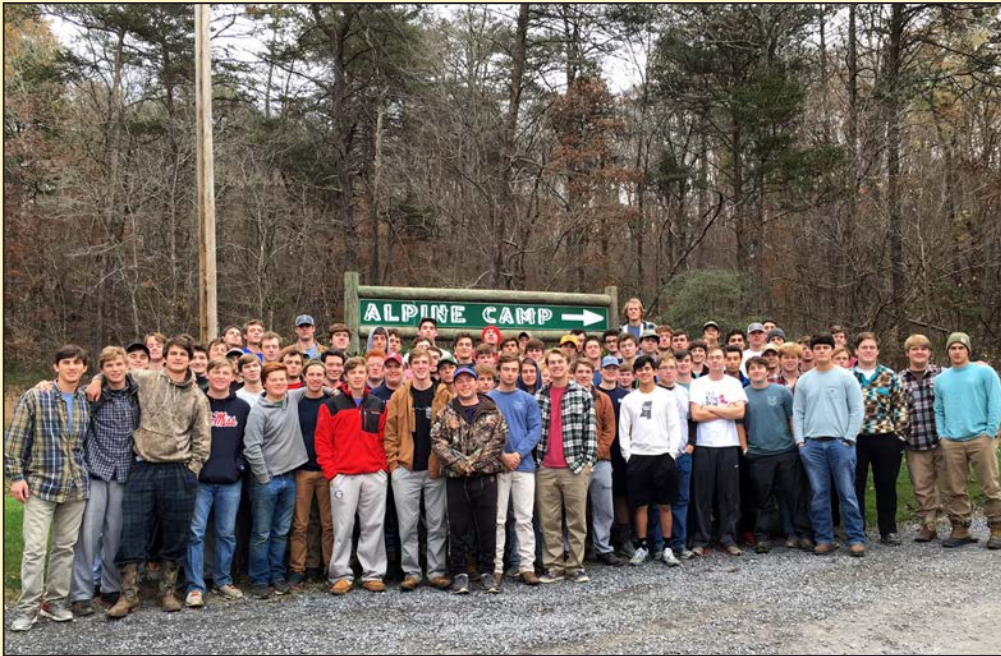
The 2015 pledge class gathers together at the main entrance to Camp Alpine at the annual pledge retreat before they embark on a weekend of brotherhood bonding and team building exercises including a high and low ropes course.