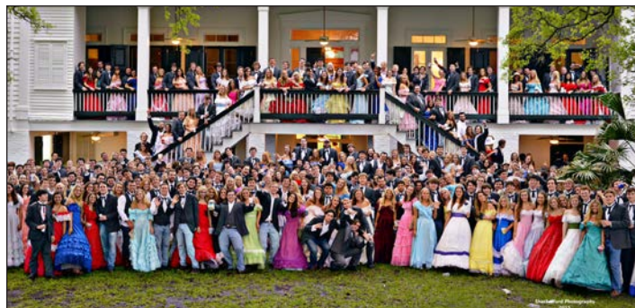
Alpha Upsilon brothers and their dates gather outside St. Joseph Plantation in New Orleans for the 2015 Rose Ball.