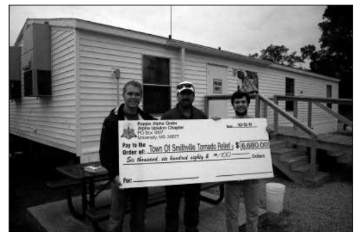
Members of Alpha Upsilon present the Mayor of Smithville with a check for $6,680. The money was raised through various campus events and will help the town rebuild after being devastated by tornadoes.