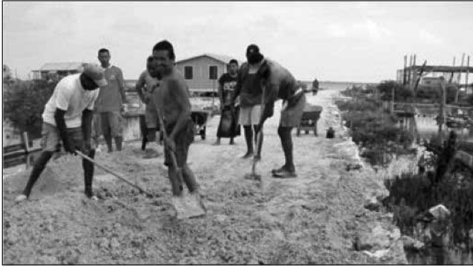
San Mateo residents build roads with supplies purchased by Ole Miss students.

Alpha Upsilon, along with the University of Mississippi, sponsored the San Mateo Run for the Road 5K on Saturday, October 29, 2011. Over 200 people participated in the event which raised more than $20,000 for the San Mateo Empowerment Project .