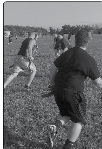
Intramural flag football