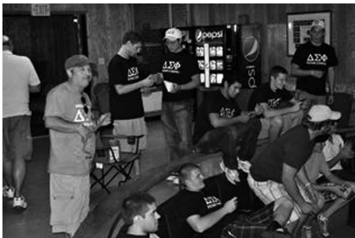
Brothers anxiously await the 50/50 raffle drawing at Homecoming 2010.