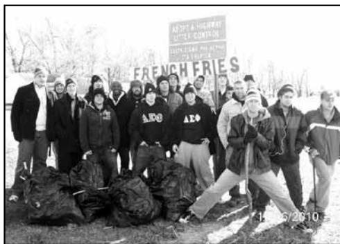
Delta Sigma brothers pickup trash along their Adopt-A-Highway mile on State Route 235.

Last quarter, the chapter logged 108 community service hours and ranked second among all campus fraternities by raising $485 for philanthropic donations. Among other causes, the chapter came up with innovative ways to support the Live Strong Foundation and American Red Cross.