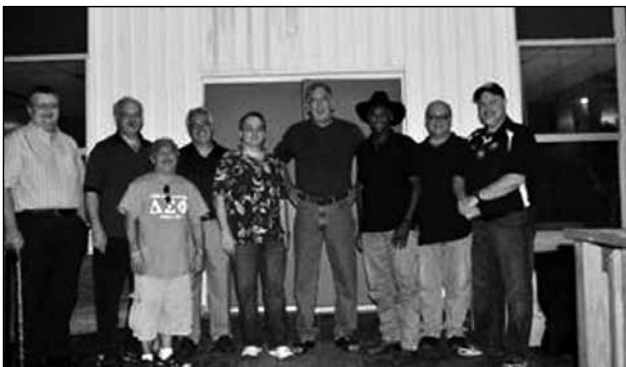
Alumni gather during Homecoming 2010. Join Delta Sigma Phi for Homecoming 2011 on October 1, 2011.