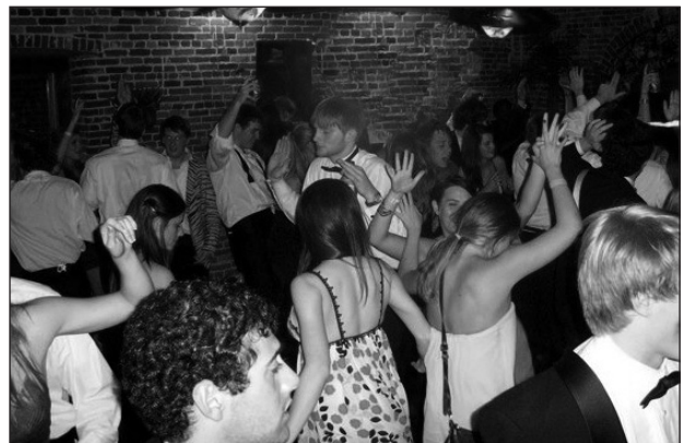
Brothers and their dates dance the night away at Formal.