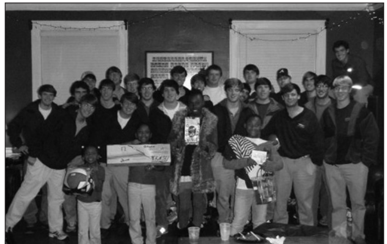
Eta brothers sponsored two families for Christmas 2009. The brothers partnered with the Boys & Girls Club and provided a large Christmas dinner and presents for four children.

Do you have news you want to share with other alumni. Did you recently marry? Have a baby? Change jobs? Start a business? Retire? Let us know. Post your news at www.chiPhiuga.com .