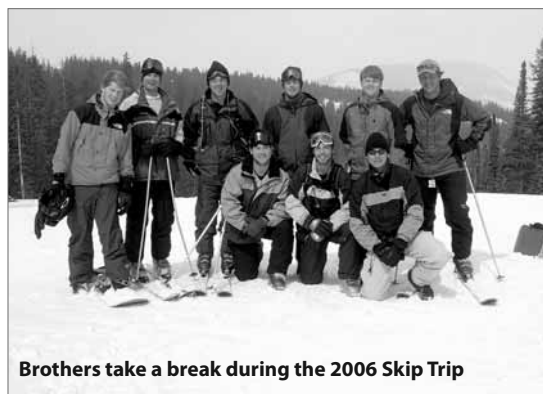
Brothers take a break during the 2006 Skip Trip