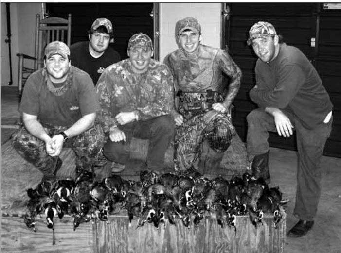
Brothers show off after a day of hunting