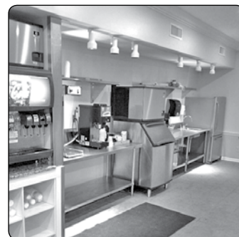
The functionality of the kitchen has improved with a new drink station that includes a new ice machine and coffee maker.

The chapter is extremely excited about the renovations that have taken place so far. Be sure to visit the chapter house and see the progress during our A-Day alumni event on Saturday, April 19 or during our Old South festivities.