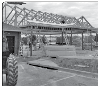
The new party barn is under construction in the side yard of the mansion.