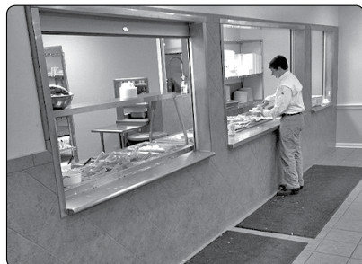
The location and layout of the new serving line eliminates the bottleneck that occurred with the previous serving line. It features a cold bar to keep salads and other cold foods easily accessible throughout the day.