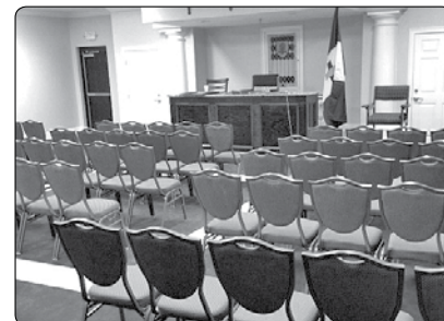
The old party barn was recently transformed into the new chapter room. The chapter is still in the process of decorating the space.