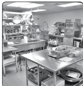
The expanded kitchen includes a new walk-in freezer, preparation table, additional dry storage space and several new appliances.